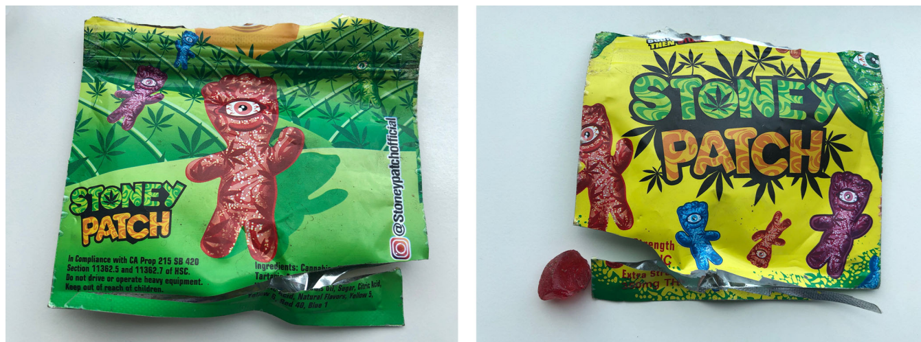
FIGURE 2 Cannabis-infused sour patch kids

investigation found that this was due to a synthetic cannabinoid, 4-cyano CUMYL-BUTINACA in many of the samples.